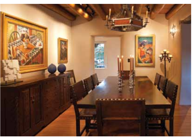
Fig. 7. Madonna of the Junipers by Henderson, 1925. Oil on artist's board, 34 ¼ by 19 % inches.

Fig. 8. In the living room, Road to Chimayo by Karl Albert (1911–2007), 1985, hangs above a nineteenth-century Mexican pine table. On the table is a collection of New Mexican bultos, or carved and painted figures of saints, by, from the left, José Rafael Aragón (active 1820–1862), José Benito Ortega (1858–