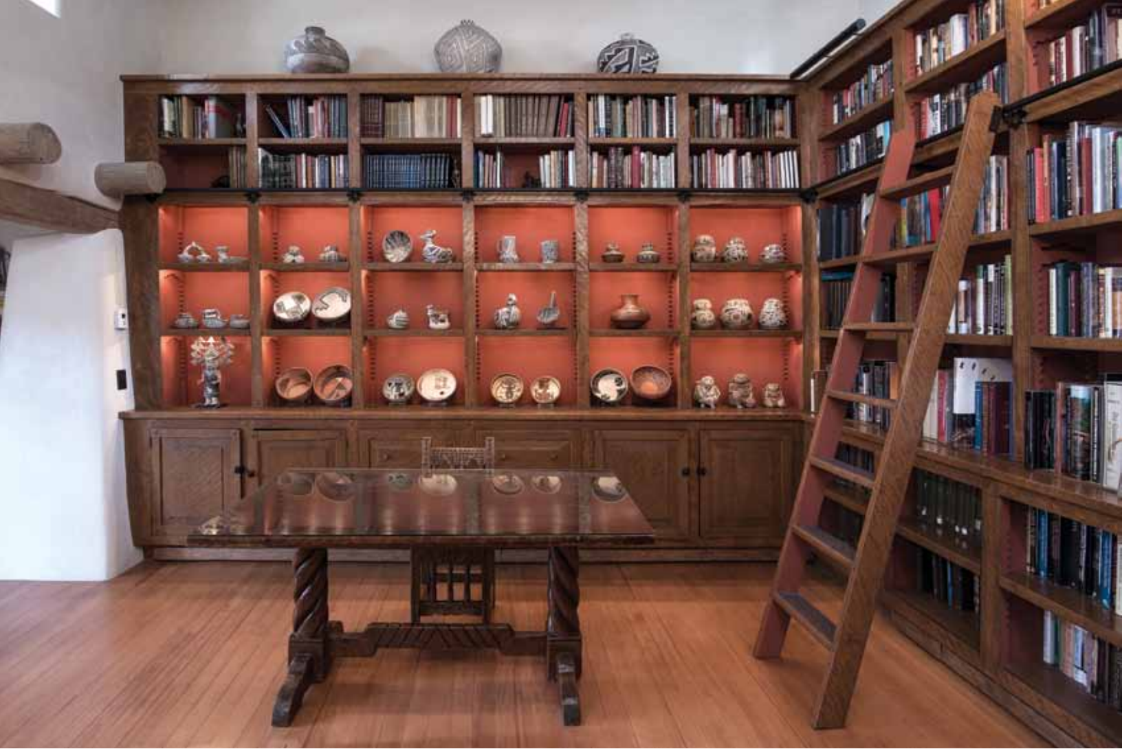
Fig. 15. Tapia built the library cabinets and shelves to house the Horns' collection of pre-historic pottery, much of which is Ancestral Puebloan from the Four Corners region near Mesa Verde National Park in Colorado. Henderson made the pine library table and chairs (one of a pair) c. 1928.