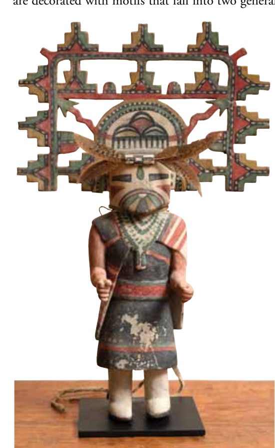
Fig. 14. Palhik Mana (butterfly maiden) kachina, Hopi, Arizona, 1930s. Painted wood; height 17, width 11 inches.

Fig. 13. Landscape, New Mexico by Andrew Dasburg (1887– 1979), c. 1924. Signed "Dasburg" at lower left. Oil on artist's board, 12 by 15 ½ inches.