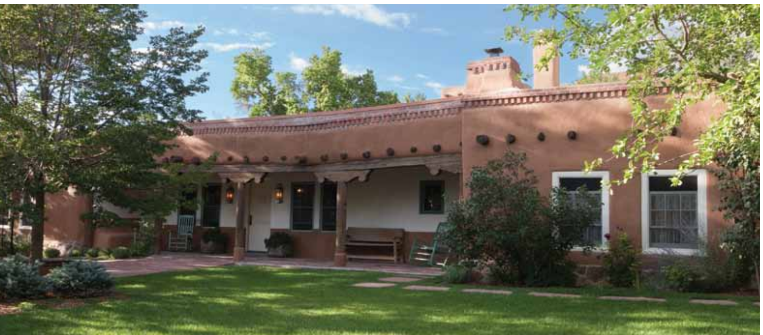
Fig. 3. The Territorial style brick coping was added sometime prior to 1965. The original house probably had few if any windows.